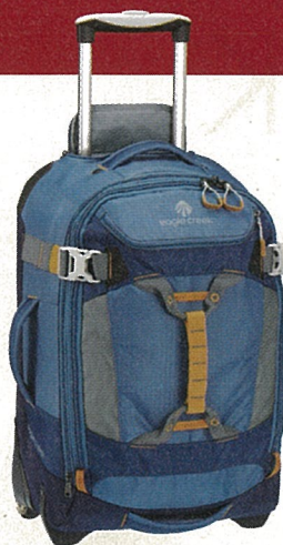
Eagle Creek Load Warrior 22

>> The Travel Gateway 22 is the least expensive and lightest wheeled carry-on upright that has a padded front computer pocket and a lifetime warranty that also covers damage by airlines. We also like that the bottom of this model is wrapped in a water-resistant material and has protective bumpers on each corner, which we believe make the bag more resistant to damage