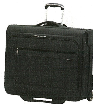
Ricardo Beverly Hills Sausalito Superlite

For more information about the above Best Buys, contact the manufacturers directly. See page 63.