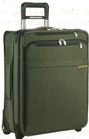
Briggs & Riley Baseline U121CXW

>> The 15-Pocket 521, which is the latest version of a previous Best Buy selection, delivers features that you typically find only in premium duffel bags, such as oversize wheels and handles, which make this model easier to handle than are other bags that are in this price range. This model's detachable see-through toiletry pouch and a